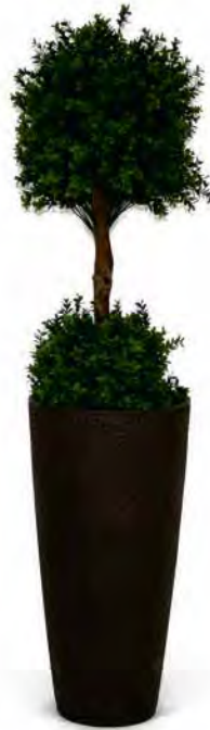
Plant: Boxwood Tree 2 Ball Pot: Brecon (Chocolate) POAPM016

Find inspiration from our selection of fresh, vibrant and colourful artificial plants and pot sets. Our pots come in a variety of appealing shapes and colours providing a beautiful setting all year round. Choose your own combination of pots and plants to suit your style. AEL deliver to site and fully install.