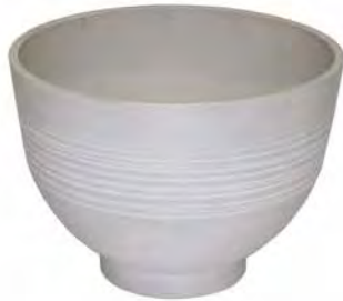
Dart Plant Pot, Medium Upright POT06