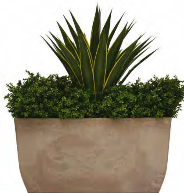
Plant: Green Yellow Sisal & Boxwood Surround Pot: Hyde POAPM024