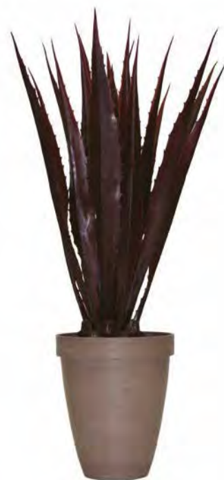
Plant: Red Sisal Pot: Coniston (Taupe) POAPM019