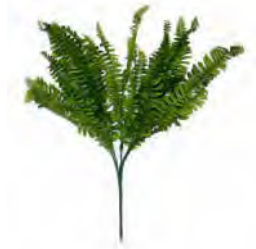
Wood Fern APWFER