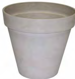
Richmond Plant Pot, Medium Upright POT04