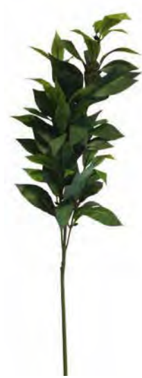
Single Bay Spray APBAS