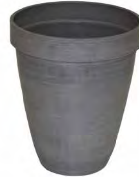
Coniston Plant Pot, Medium Upright POT10