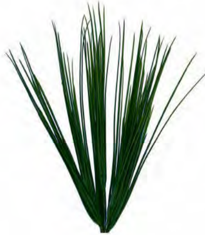
Green Onion Grass