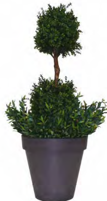
Plant: Boxwood Tree 2 Ball & Olive Tree Pot: Regents (Charcoal) POAPM029