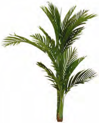
Areca Palm APAPT