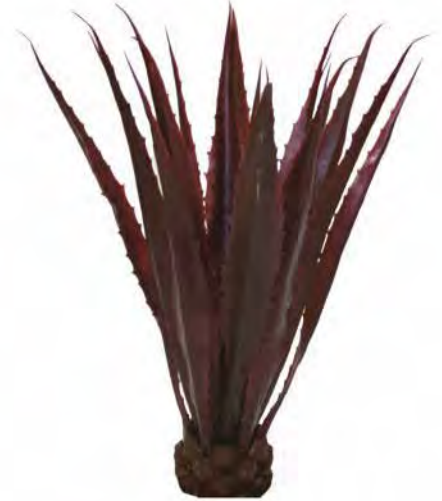
Red Sisal APSIR