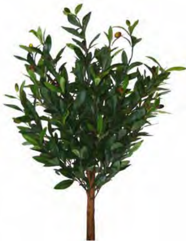
Olive Tree APOLT2