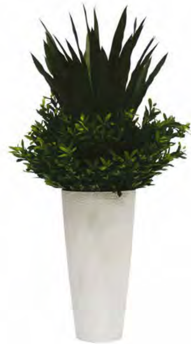
Plant: Olive Tree & Green Sisal Pot: Brecon (White) POAPM017

Pot: Ø 350 x H 700mm Dimensions shown are for Pot only