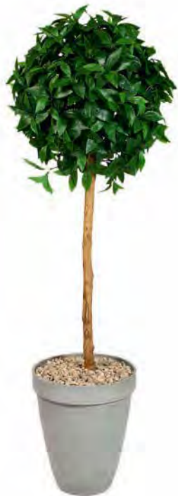
Plant: Bay Tree Pot: Coniston (Light Charcoal) POAPM037