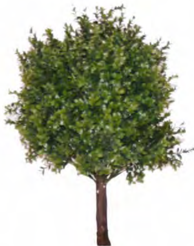
Boxwood Tree APBOXT1