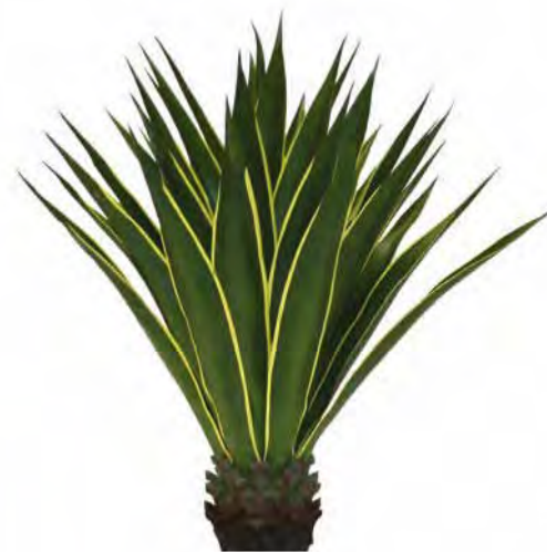
Green Yellow Sisal APSIY