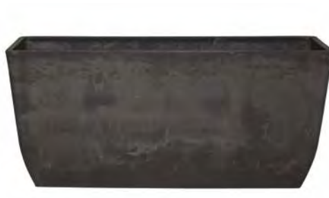
Holland Plant Pot, Rectangular POT010CC