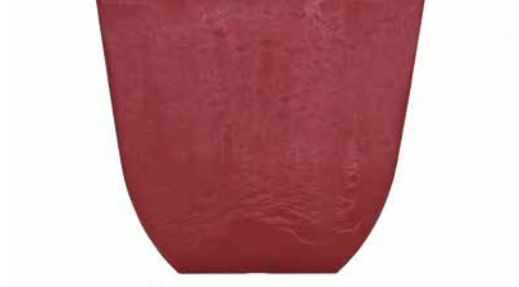
Victoria Plant Pot, Tapered Base POT020RE