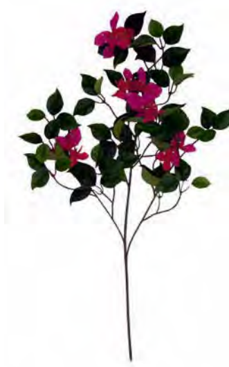
Bougainvillea Spray APBOU