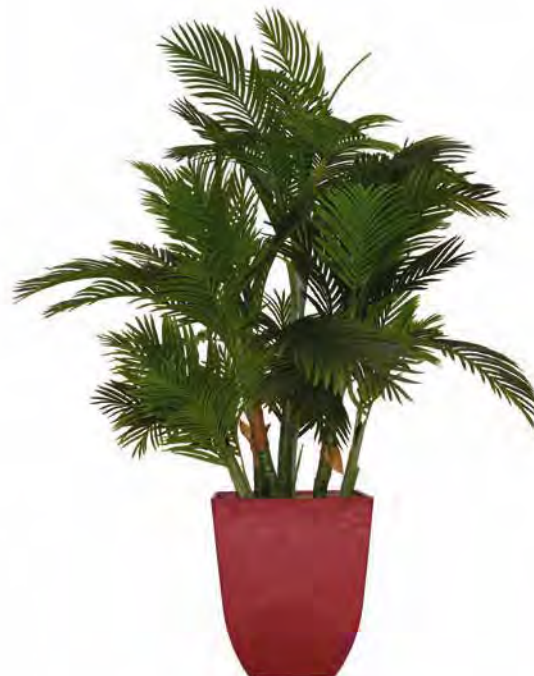
Plant: Areca Palm 150cm Pot: Victoria POAPM034