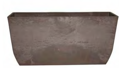
Hyde Plant Pot, Rectangular POT001TA