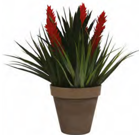
Plant: Tropical Plants with Green Yucca & Dragon Leaves Pot: Richmond (Taupe) POAPM030