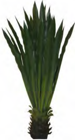
Dragon Leaves Tree APDL