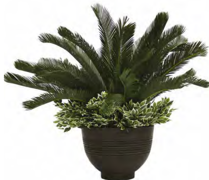
Plant: Cycad Tree & Ficus Tree Pot: Dart (Charcoal) POAPM020