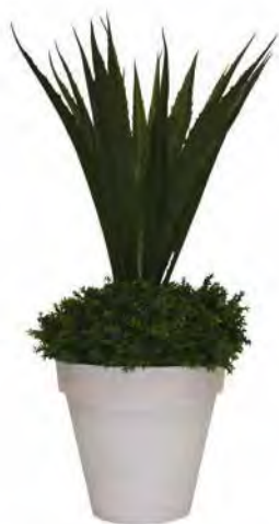
Plant: Green Sisal & Boxwood Spray Pot: Richmond (White Stone) POAPM031