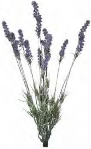
Lavender Loose Spray