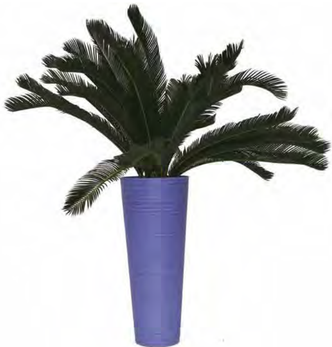
Plant: Cycad Tree Pot: Peak (Purple Blue) POAPM028