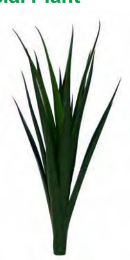
Green Yucca APYUPG