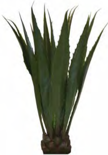
Green Sisal APSIG