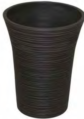
Skiddaw Plant Pot, Medium Upright POT09