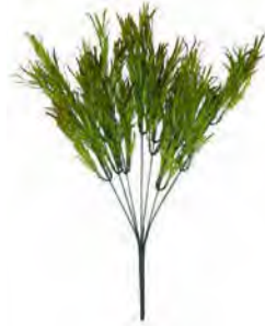
Rimu Bush APRIM