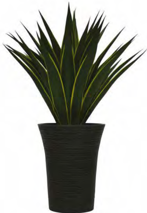
Plant: Green Yellow Sisal Pot: Skiddaw (Charcoal) POAPM032