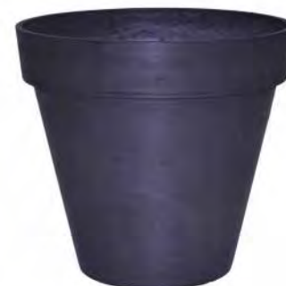
Regents Plant Pot, Medium Upright POT05