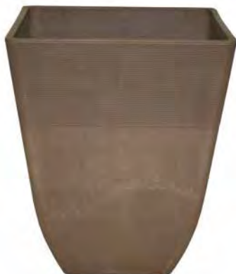
Grasmore Plant Pot, Tapered Base POT030TA