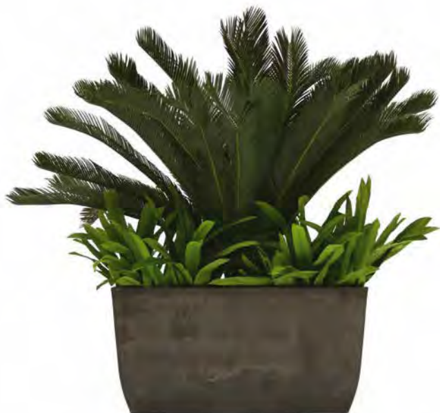
Plant: Cycad Tree Pot: Holland POAPM023