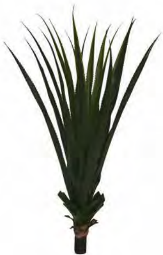
Green Sisal APSIG100